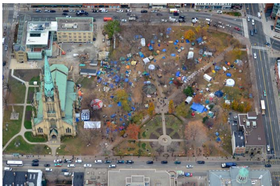
ARIAL VIEW OF OCCUPYTORONTO ENCAMPMENT