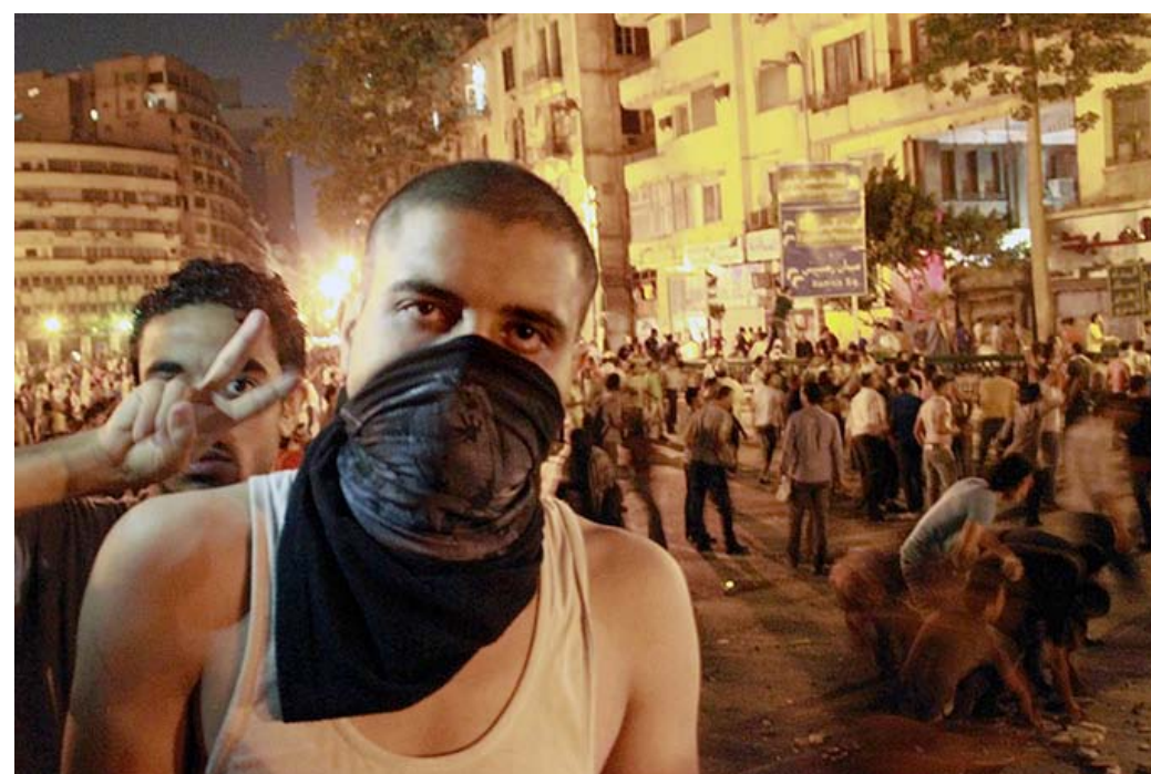
YOUTH OF TAHIR

Since a brief holiday hiatus, our General Assembly has re-formed and plan to continue our work well into the new year. First on the agenda is solidarity with London's locked out Electro-Motive (Caterpillar) workforce and opposition to plans for privatized health care. By reaching out across issues that affect our communities, Occupy Hamilton is hoping to connect people and struggles and to forge a broader and stronger movement in our city and beyond.